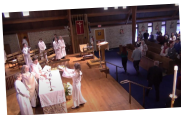
2024 You Tube Views of Worship Services: Live Stream & Recorded