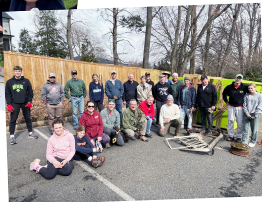
Creation Care Workday