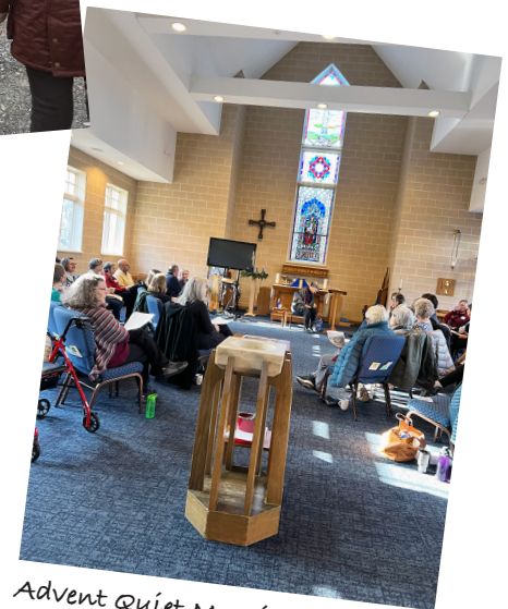
Advent Quiet Morning 12-14-24