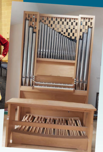
Chapel organ built by Neiland & Creane Organ Builders, Newtown, Killinick, Co. Wexford, Ireland