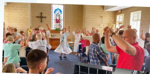
2nd Saturday Church