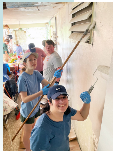
Youth Mission Trip

We hope to expand outreach; reignite more youth group events; encourage more youth to join immersive faith retreats; continue to foster a thriving acolyte, lector, and eucharistic minister programs; and develop a social media presence to share activities, encourage participation, and reach more youth in our community.