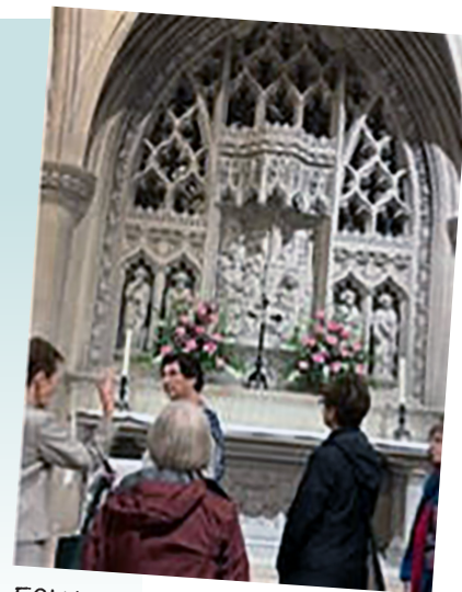
ECW Tour of National Cathedral