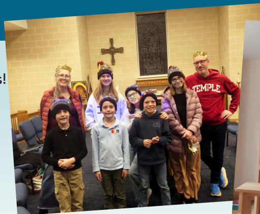
Chorister Christmas Party

We continue to eagerly anticipate the renovation of the third floor of McGill Hall. We are in the process of forming a Music Ministry Guild to enable interested persons to get involved in new ways to support and grow the ministry. We plan to hold music workshops to encourage and develop singing within the congregation.