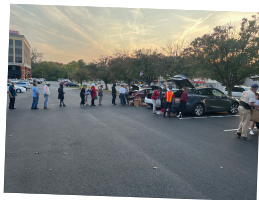
Youth Group FACETS Outreach