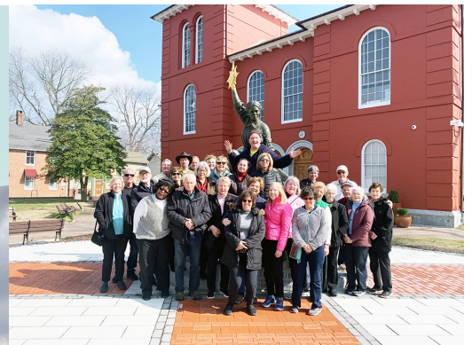
Harriet Tubman Pilgrimage 2-24-24