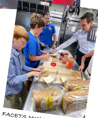
FACETS Meal Preparation