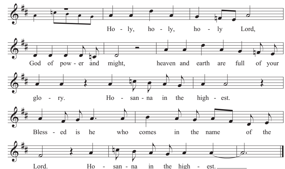
The Presider continues and gives thanks to God for the reconciling work of Christ and prays over the bread and wine.