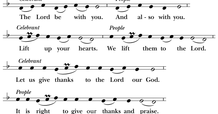
THE GREAT THANKSGIVING [The people stand.] Prayer 2, Enriching Our Worship

Let thy people praise Thee, Lord, Be by all that live adored; Let the nations shout and sing Glory to their Savior King; Let all be below, above, One in joy and light and love.