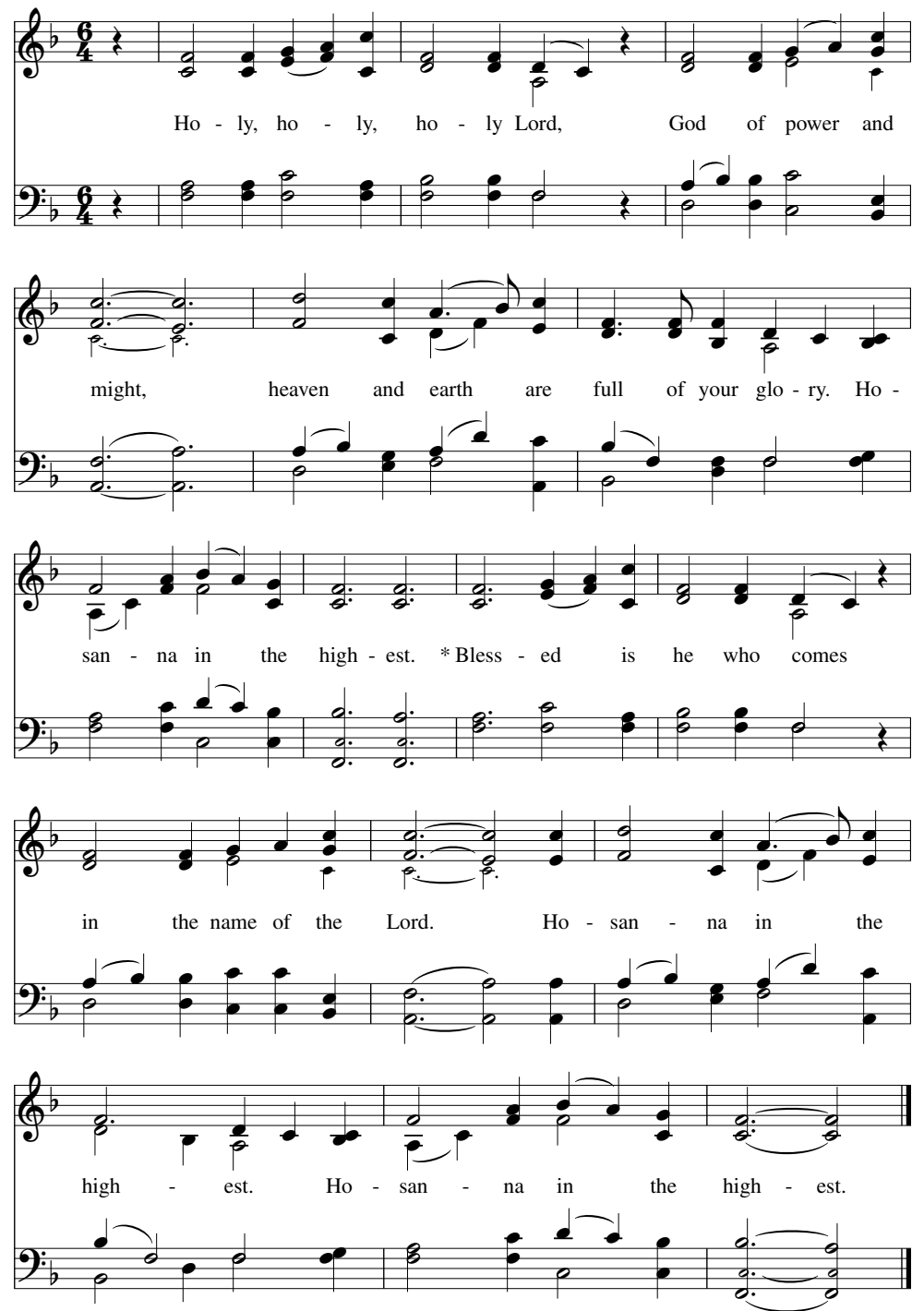
The Presider gives thanks to God for the reconciling work of Christ and prays over the bread and wine.